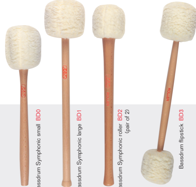
Bassdrum Symphonic small BD0 Bassdrum Symphonic large BD1 Bassdrum Symphonic roller BD2 (pair of 2) Bassdrum flipstick BD3