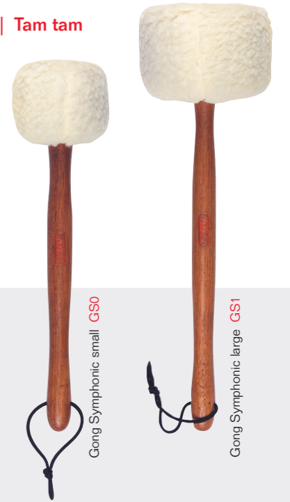
Gong Symphonic small GS0 Gong Symphonic large GS1