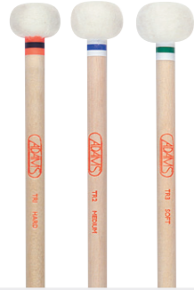
Timpani Birch hard TR1 Timpani Birch medium TR2 Timpani Birch soft TR3