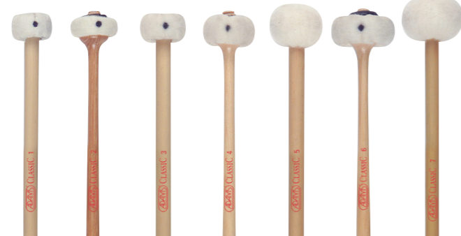
Bamboo cartwheel CD1 Very bright and brilliant Hickory cartwheel CD2 Bright Bamboo cartwheel CD3 Warm, Sonorous Hickory cartwheel CD4 Legato Bamboo ballstick CD5 Dark, Mellow Hickory cartwheel CD6 Soft, rich Bamboo ballstick CD7 Dark, Sonorous, Rich Hickory wood stick CD8 Extremely hard, Bright Hickory Flip stick CD9 Extremely bright to general Hickory Chamois stick CD10 Very brilliant to articulate