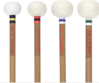
Timpani tonkin staccato TT0 Timpani tonkin hard TT1 Timpani tonkin medium TT2 Timpani tonkin soft TT3