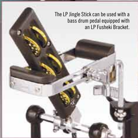
The LP Jingle Stick can be used with a bass drum pedal equipped with an LP Fusheki Bracket.

LP182-S Jingle Kick with Nickel-Plated Steel Jingles