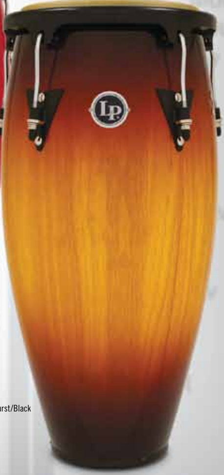
Vintage Sunburst/Black YSB