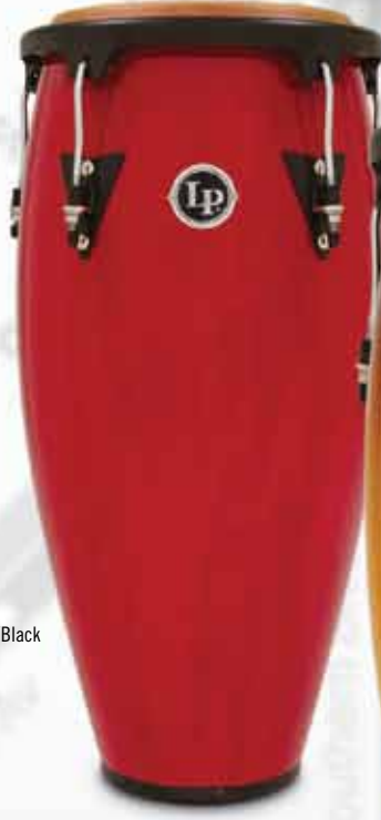
Red Wood/Black RW