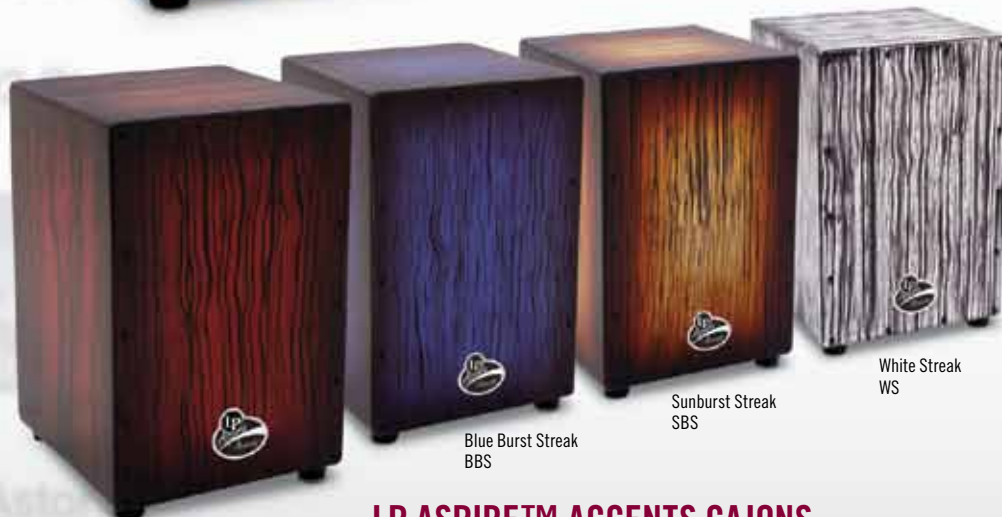
Dark Wood Streak DWS