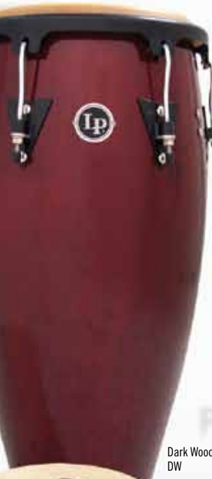
Dark Wood/Black DW