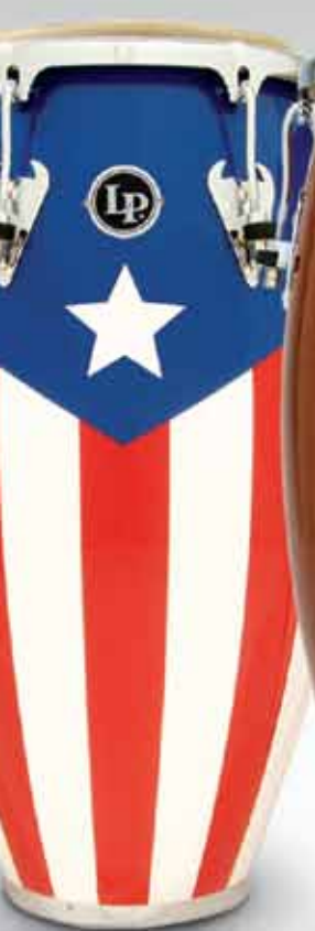
Puerto Rican Heritage Flag/Chrome PR