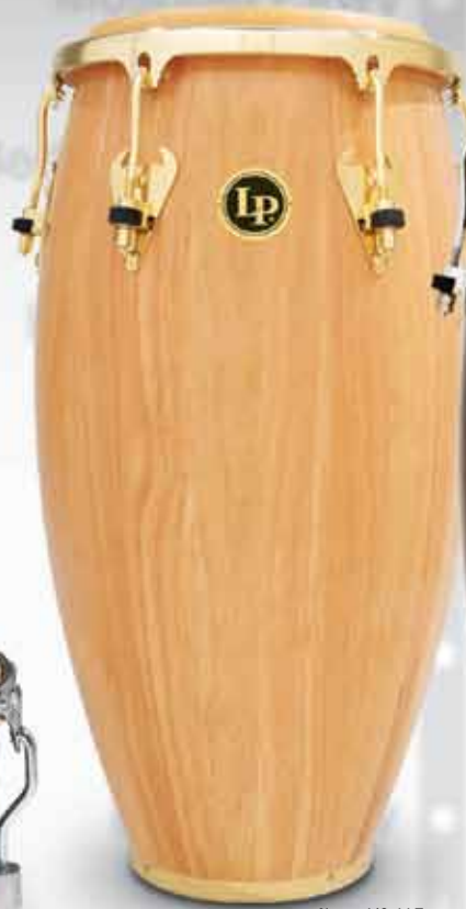
Natural/Gold Tone AW