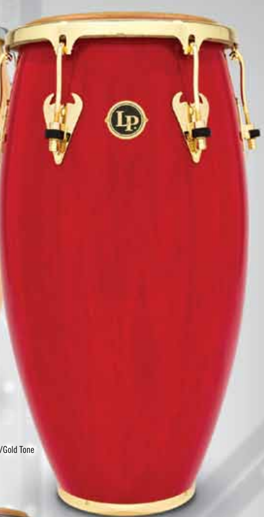
Red/Gold Tone RW