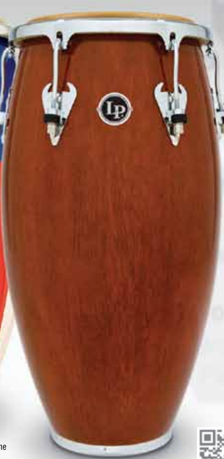
Almond Brown/Chrome ABW