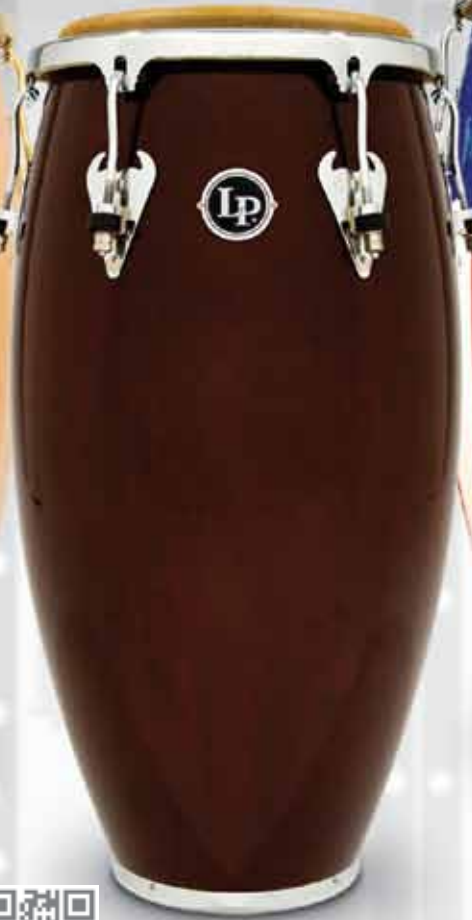
Dark Brown/Chrome W