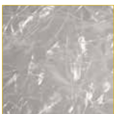
Jumbo White Pearl - JW

LLC5003LXBS 8x12" Tom, 14x14" Floor Tom, 14x20" Bass Drum. Shown with matching 5x14" snare and Atlas Classic Hardware. Shown in Vintage Burgundy Sparkle (BS)