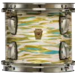
Blue / Olive Oyster – 2P