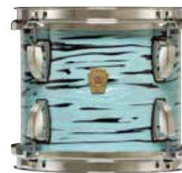
Turquoiser – TQ