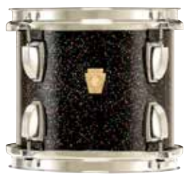
Black Galaxy – BG