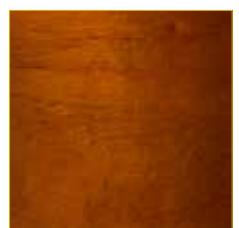
Mahogany Satin - MH