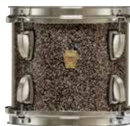
Galaxy Bronze – GB