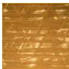
Aged Onyx Marine - AO