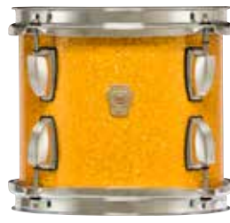
Gold Sparkle – 33