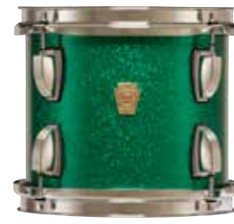
Green Sparkle – 54