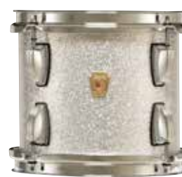
Silver Sparkle – 0S