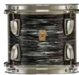
Vintage Black Oyster – 1Q