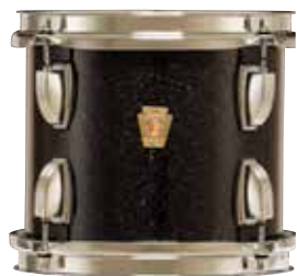
Black Sparkle – 0R