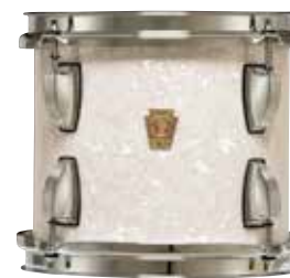
White Marine Pearl – 0P