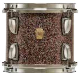
Apple Glass – AG