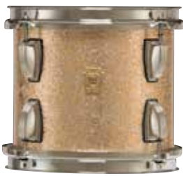
Shampayne – SP