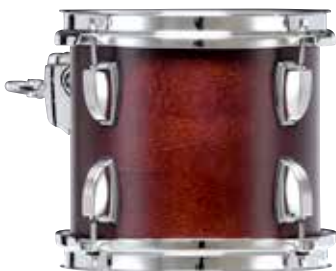
Cherry Satin – SL

7x8", 8x10", 9x12" Toms, 14x14", 16x16" Floor Toms, 18x22" Bass Drum. Shown with 6.5x14" Supraphonic snare and Atlas Pro Hardware. Shown in Natural Maple Satin (SN)