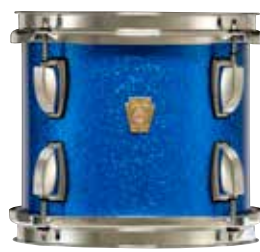
Blue Sparkle – 32