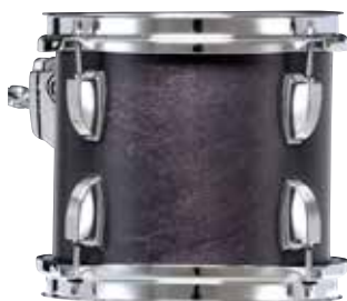
Charcoal Satin – SY