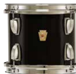
Black Cortex – 0G