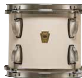
White Cortex – 0F