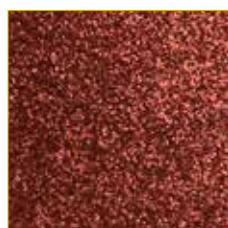
Vintage Burgundy Sparkle - BS