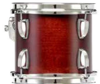
Mahogany Satin – SM