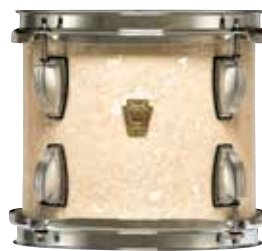
Vintage White Marine – NM