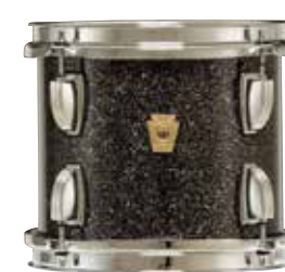
Granite Glitter – GM