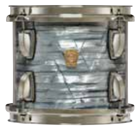
Sky Blue Pearl – 52