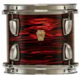
Red Oyster Pearl – RP