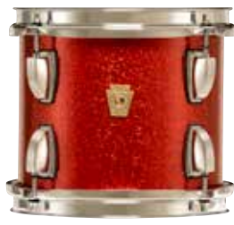
Red Sparkle – 27