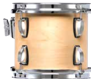
Natural Maple Satin – SN