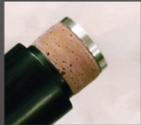
Upper joint fitted together with the crimped metal lower joint