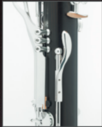
Adjustable thumb rest