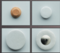
Efficient sealing: leather pads fitted with resonators for the low notes (except Eb), Gore-Tex pads on the upper join and cork pads for the 12 th key