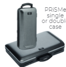
PRISMe single or double case