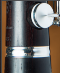
New ring design

The original laser engraving on the bottom body of the instrument is inspired by the values of generosity, listening and transmission of the musical practice.