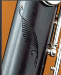
The feather, a symbol of lightness and creative freedom