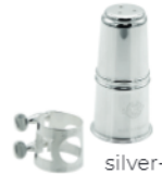
silver-plated ligature and cap

Echo is a universal mouthpiece suitable for all clarinetists and the first Henri SELMER Paris clarinet mouthpiece to be entirely manufactured on a digitally controlled machine, giving it an unprecedented production stability.