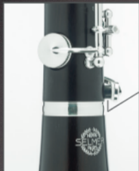
Correction tone hole for low E on the lower joint!