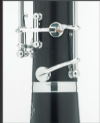
Correction system for low F and E notes with adjusting screw