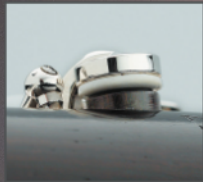
G#/C# precision optimized by a raised tone hole