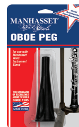
#1470 Oboe Peg