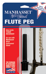
#1440 Flute Peg