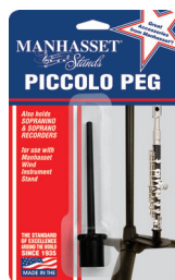
#1430 Piccolo Peg