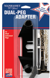
#1420 Dual Peg Adapter

Single Peg Wind Instrument Stand System shown.