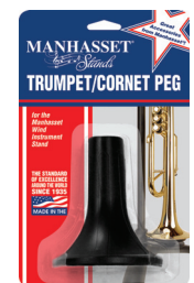
#1480 Trumpet/Cornet Peg