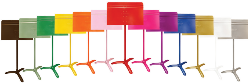
Model #48 Colored