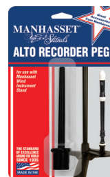
#1460 Alto Recorder Peg