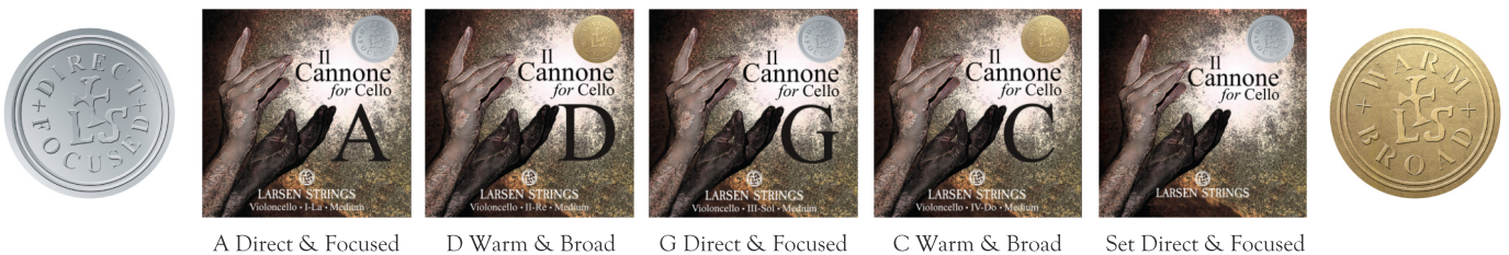
A Direct & Focused D Warm & Broad G Direct & Focused C Warm & Broad Set Direct & Focused

Both C and G strings have steel rope cores and tungsten windings, while both Ds and the 'warm and broad' A have solid steel cores and stainless steel windings. The 'direct and focused' A string uses a unique material that is currently being patented.