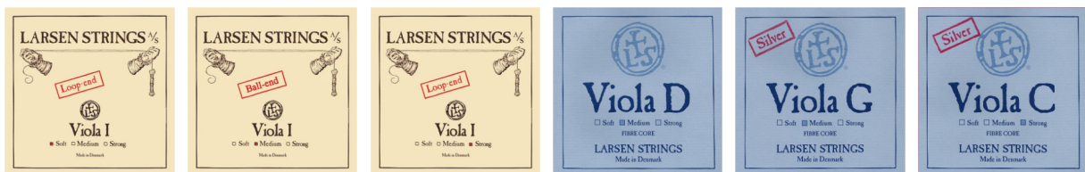
A Soft Loop A Medium Ball A Strong Loop D Medium G Silver Medium C Silver Strong

'Medium lends a lovely mellow sound, while strong offers brightness and power.'