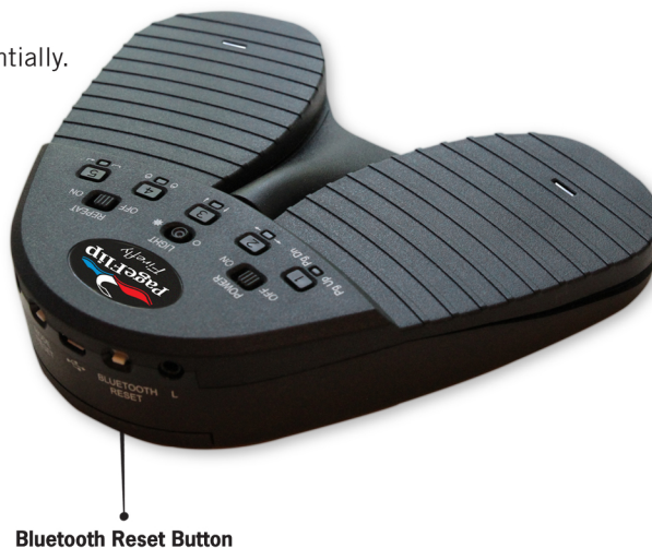
Bluetooth Reset Button

Single light will flash slowly on Pedal when connected.