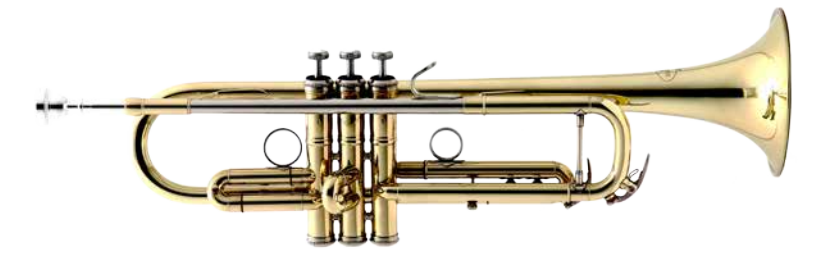
110 model: Adjustable finger ring