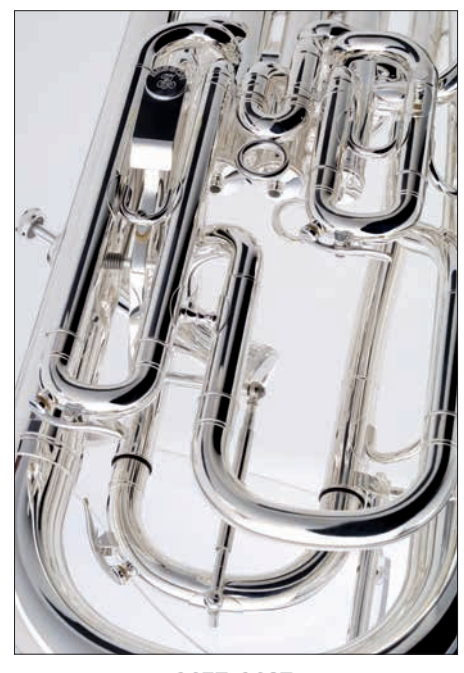
967T, 968T: Main tuning slide trigger