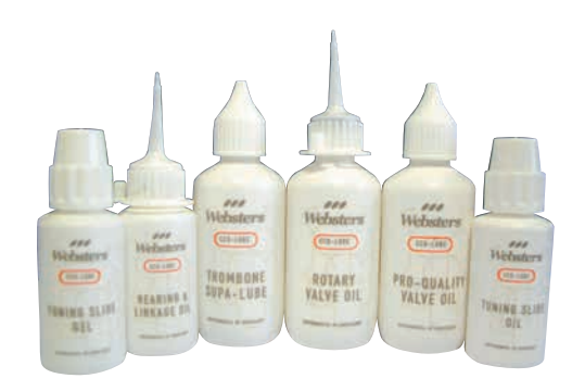
OILS AND LUBRICANTS