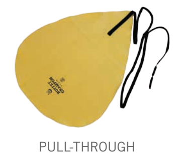
Buffet Crampon 37