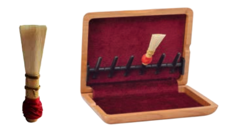
REEDS AND REED CASES