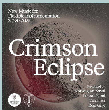
CRIMSON ECLIPSE New Music for Flexible Instrumentation 2024-2025