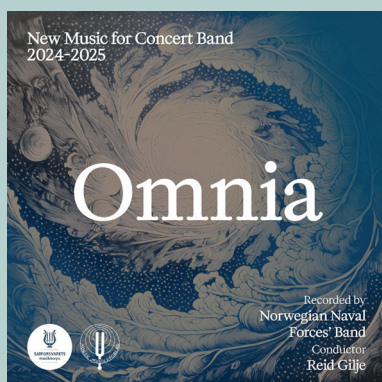
OMNIA New Music for Concert Band 2024-2025

Full recordings of the new titles is this catalogue available for download and streaming: