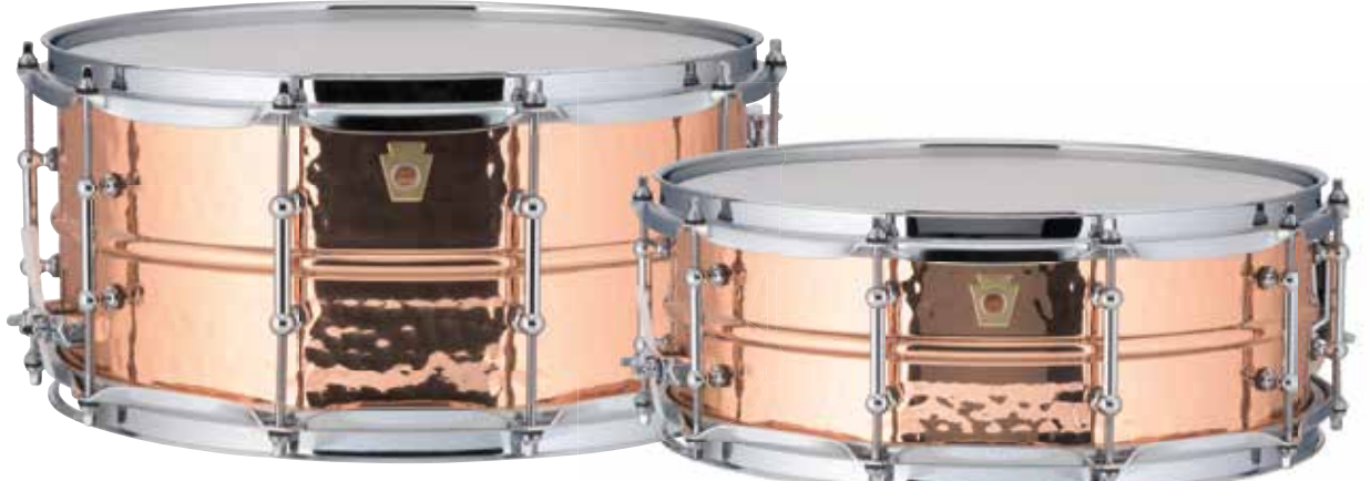
6.5x14" Hammered Copper Phonic w/Tube Lugs (LC662KT)