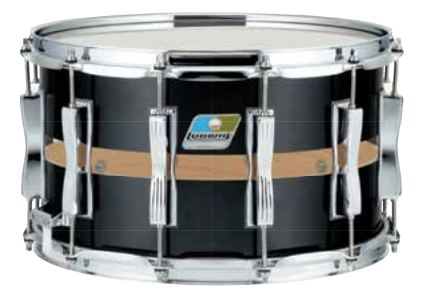
8x14" Slotted Coliseum, Black Cortex (LS1284XXXG)