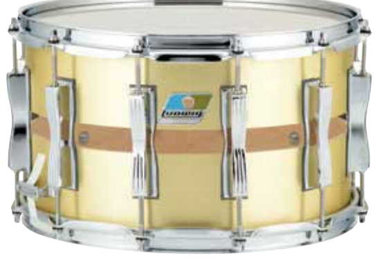
8x14" Slotted Coliseum, Brushed Gold (LS1284XX46)