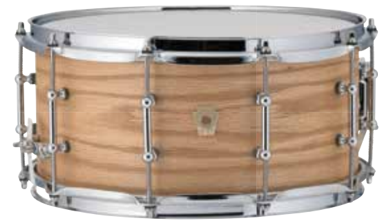
6.5x14" Classic Maple, Natural Oak finish (LS403TXBO)