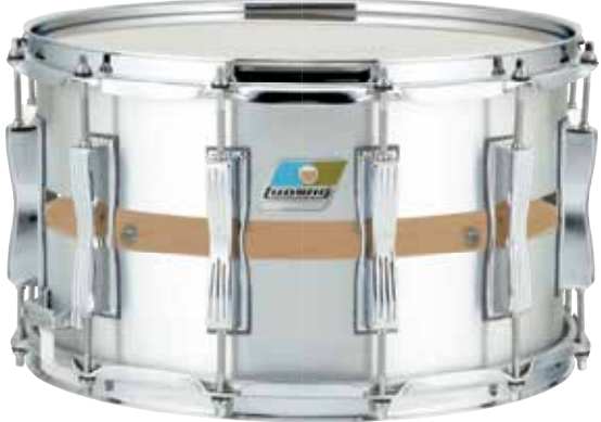
8x14" Slotted Coliseum, Brushed Silver (LS1284XX45)