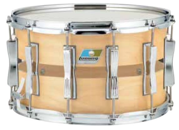
8x14" Slotted Coliseum, Maple Satin (LS1284XXSN)