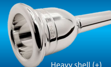
Heavy shell (+)