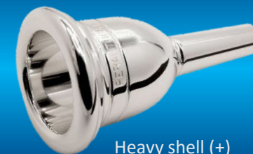
Heavy shell (+)

Tuba, Euphonium, Trombone and Sousaphone Mouthpieces for Twenty-First Century Musicians