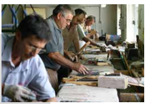
Process: smoothing and sanding